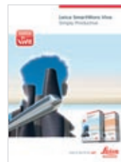
Leica SmartWorx Viva Product brochure