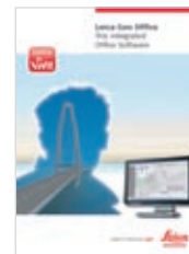
Leica Viva LGO Product brochure