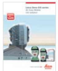
Leica Zeno Product brochure