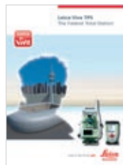
Leica Viva TPS Product brochure