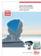
Leica Viva GNSS Product brochure